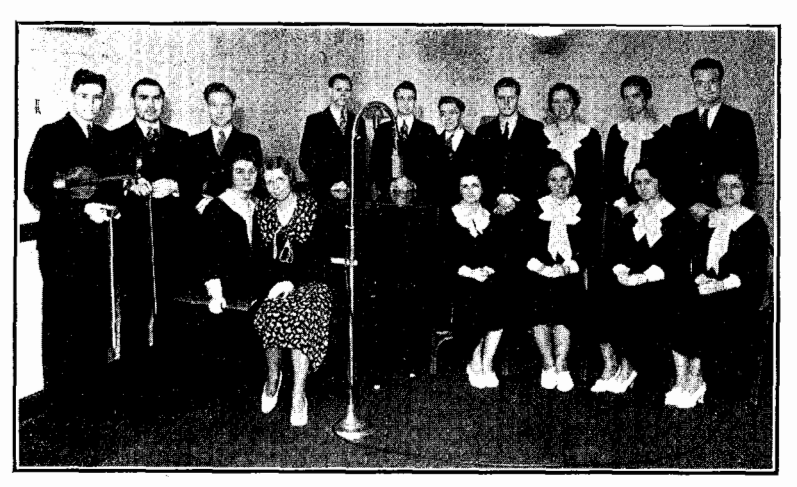
Group of C. B. I. radio workers.

rooms and halls of this institution constitute one of the most holy environments that can be found. The Spirit of God broods over the